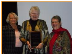
Mary Yearns Distinguished Service Award